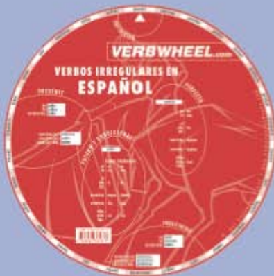
Verbos Irregulares en Español ISBN 3-936361-37-1

Shows the Präteritum and Perfekt forms of the 160 most important irregular German verbs, their English translations and whether each verb takes haben and/or sein in the Perfekt tense. Also comes with French and Spanish translations, as well as in a CD-size monolingual format (see back page).