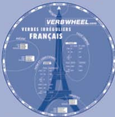
Verbes Irrégulières - Français ISBN 3-936361-34-7