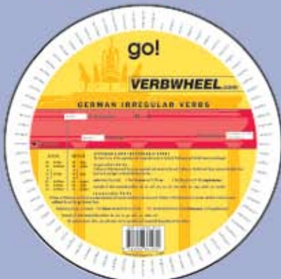
German Irregular Verbs ISBN 3-936361-07-X